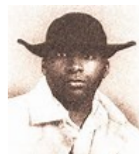
York: Lewis & Clark Expedition Member