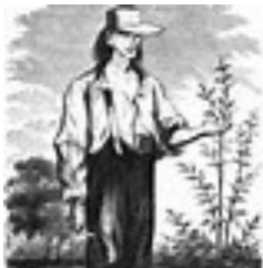
Johnny Appleseed: Naturalist and Folk Hero

At the July 16-20 Chautauqua, the following historical figures will be featured.