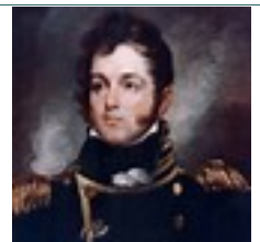
Oliver Hazard Perry: Hero of the Battle of Lake Erie